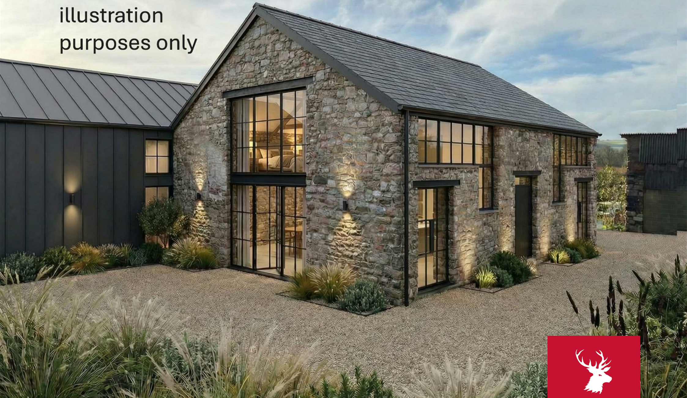
Lower Barn, Normans Farm